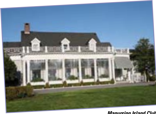
Manursing Island Club