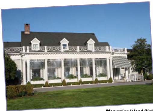
Manursing Island Club