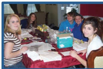
Goshen Middle School students hard at work

If you would like to become involved with this program, please visit our website at www.haileyshopefoundation.org or contact us at (914) 584-8833.