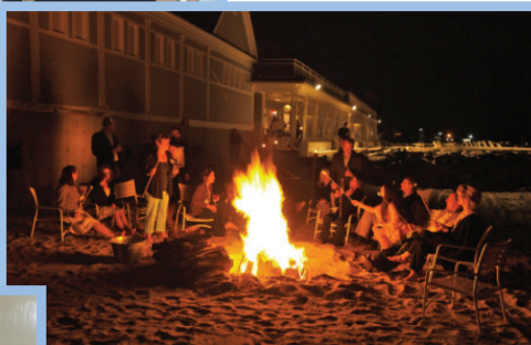
Guests enjoyed roasting marshmallows by the beach bonfire