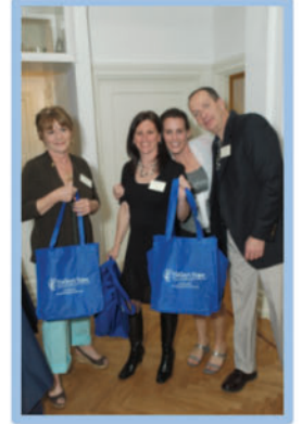
Board members hand out goody bags to guests