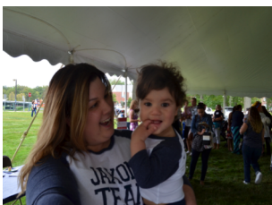
The Tedeschi Family