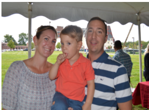
The Sivulich Family